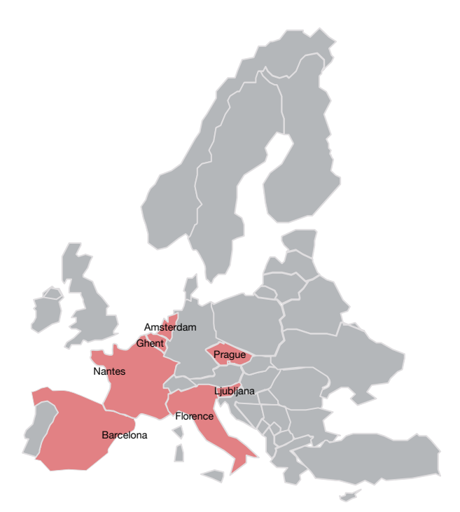
Figure 1. Map showing the cities analysed in the report